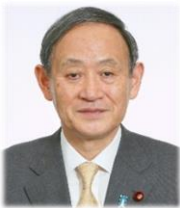
SUGA Yoshihide Prime Minister