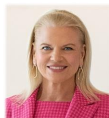
Virginia M. ROMETTY Former Chairman, President and CEO, IBM (USA)