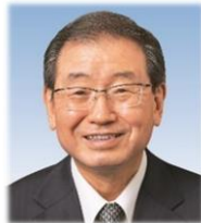
TOKURA Masakazu Chairman, KEIDANREN (Japan Business Federation)