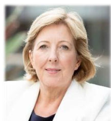
Fiona REYNOLDS CEO – PRI (Principles for Responsible Investment) (United Kingdom)