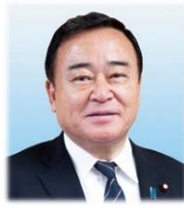
KAJIYAMA Hiroshi Minister of Economy, Trade and Industry